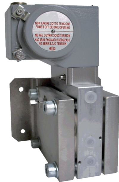
Compact differential pressure switch model DCA