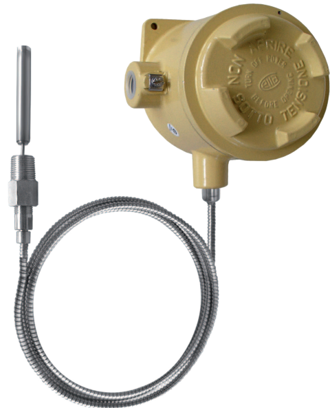
Temperature switch model TAG